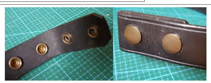
Press-studs on a buckle turn (for a Western-style buckle)

be used on another belt (or belts), or you have your own buckle already and require a new (or replacement) belt, we can use Chigago screws, or press-studs (popfasteners).