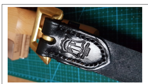
Rear of a hand-stitched belt

We normally hand-stitch our buckles, using a traditional saddle-stitch, as shown in the photos, but alternative methods are available. If you want the buckle to be permanently mounted to the belt, stitching is the best, but rivets can also be used on request.